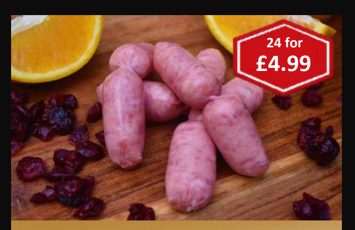
Christmas Cocktail Sausages Made with fresh oranges and cranberries, our limited edition

Traditional cocktail sausages with all the great flavour and texture as our classic pork sausages. Small is size, big in taste.